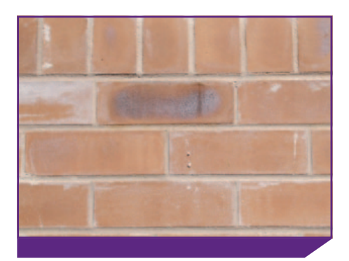
Signs of manganese staining