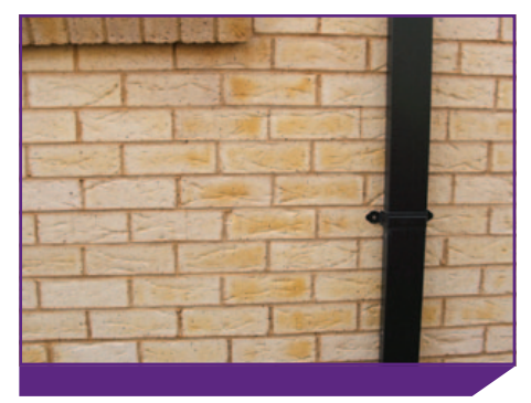
Acid burn on light coloured bricks