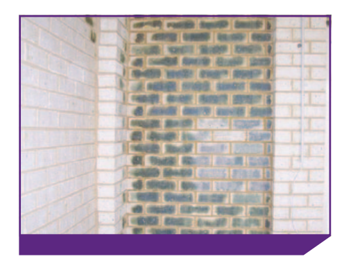
Vanadium stain not removed prior to hydrochloric acid application