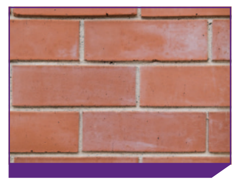
Typical calcium stain from wet sponging mortar joints