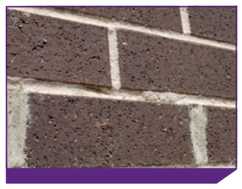
Damage to ironed mortar joint

6. Allow the cleaning solution to remain on the wall to allow the chemical reaction to take place, this could take up to 3 to 6 minutes, however for bricks manufactured in Queensland and Western Australia a lesser time is advised or secondary staining can occur.