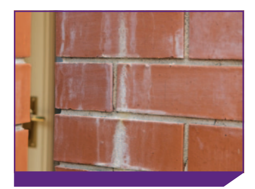
Calcium stains leaching from adjacent concrete balcony