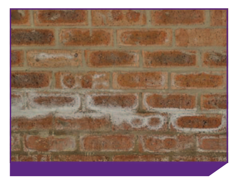
Effloresence from ground salts